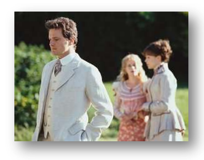
Colin Firth in the movie version 2002